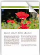
Normal colour print